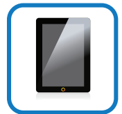
Fingerprint & Scratch Free