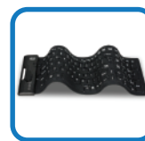
Flexible & Portable