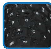
Durable Waterproof Design