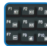
Multimedia & Internet Hotkeys